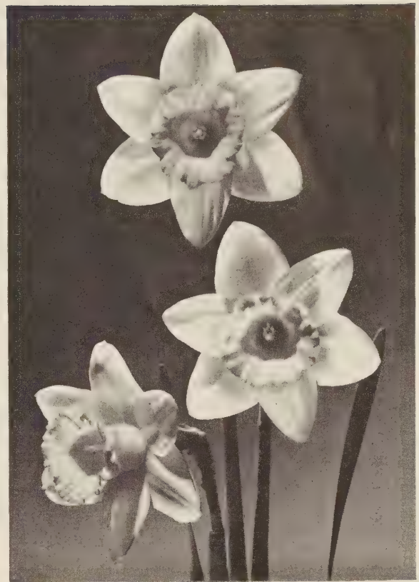
GOLD CROWN (Incomparabilis)